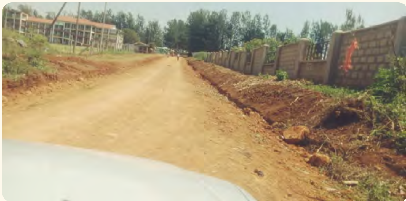
Awendo Campus access road.

In collaboration with the County Government of Migori, KMTC Awendo Campus now benefits from a newly gravelled and improved half-kilometer access road, enhancing accessibility for students and staff.