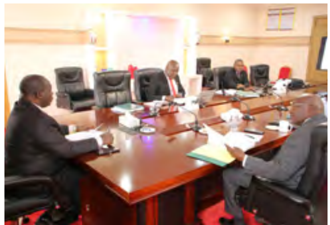
Board's Audit Committee during a session at the headquarters.