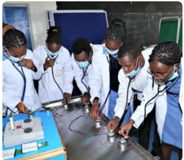
FILE PHOTO: Clinical Medicine students during a practical session.

This specialized course, set to launch at KMTC Nairobi Campus this September, is designed to equip Clinical Officers with advanced skills in forensic medicine, effectively bridging the gap between healthcare and the justice system. The validation process is a critical step in ensuring the course meets the highest national and international standards, reflecting our dedication to providing cutting-edge training that empowers our students to excel in their professions