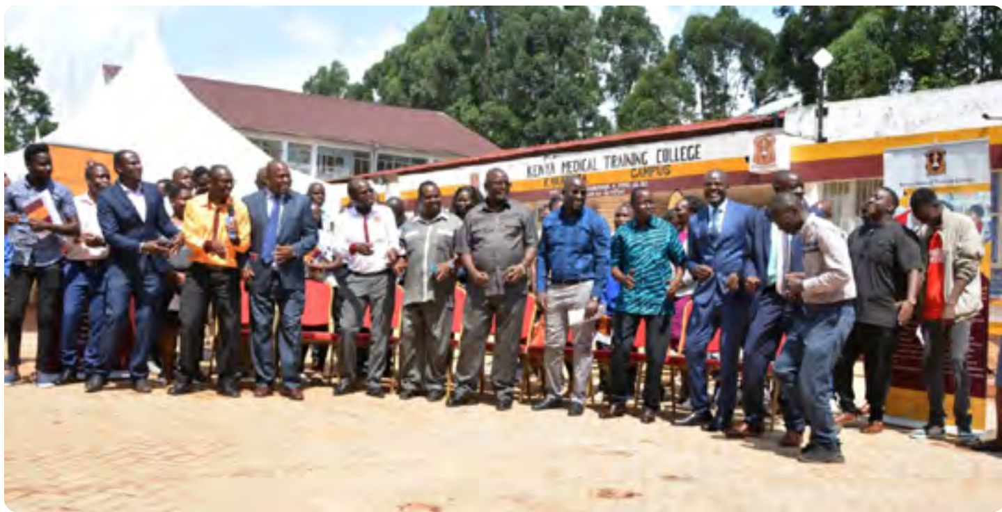
Kakamega Campus Alumni showcase their dancing skills during the launch of the Alumni Chapter.

O n August 9, 2024, KMTCC Kakamega witnessed a momentous event as alumni from various graduating classes converged on the campus grounds to build a robust and supportive alumni network. The gathering was marked by a spirit of unity and commitment to strengthening connections among former students.