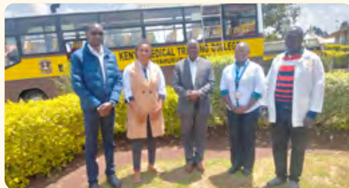
KMTCC staff and Nursing Council of Kenya officials during a visit to Nyahururu Campus.

Following a successful intake of nursing students, KMTCC Nyahururu hosted a team from the Nursing Council of Kenya, Standards Department. The purpose of the visit was to evaluate their readiness for approval to conduct a second intake of nursing students.