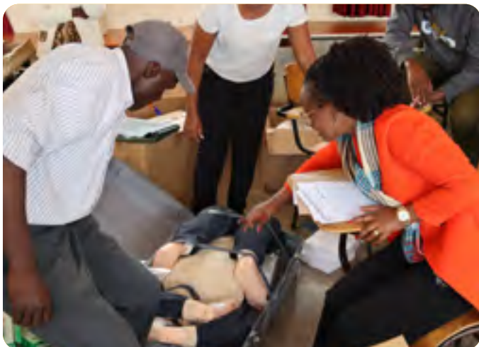
KMTC Mbooni receives skills lab equipment in preparation for mounting nursing programme.