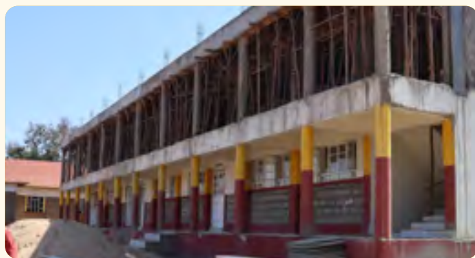
Mbooni Campus tuition block under construction.

The second phase of construction is a crucial step in realizing the campus's vision for improved educational facilities.