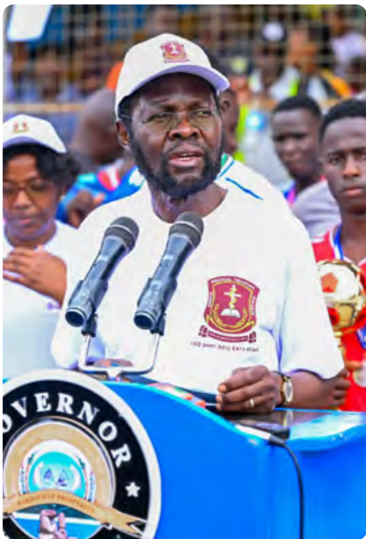
Kisumu County Governor Prof. Peter Anyang Nyong'o during the official closing ceremony.

to strengthen bonds and build lasting friendships” he said.