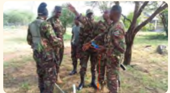
KDF surveyors at Chemolingot Campus.

President Ruto emphasized the importance of education in transforming the region, urging residents to embrace learning and shun detrimental practices like cattle rustling. “We have built KMTC and other technical training institutions to provide your children with opportunities for education and employment,” he stated.