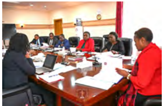
Board's Finance, Planning and Development Committee during a meeting at the headquarters.