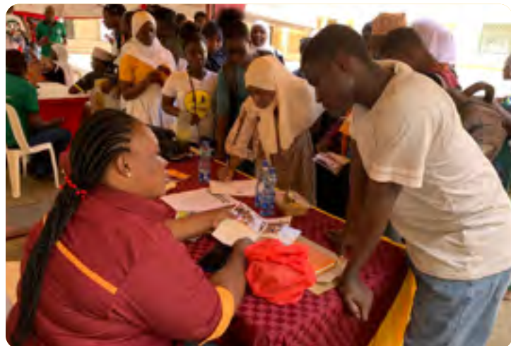
Kwale and Msambweni campuses during the PEPEA scholarship program career mentorship.